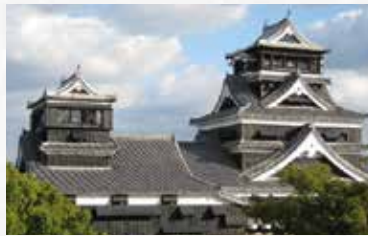
Kumamoto: Kumamoto Castle