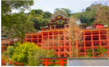
Kashiwa: Yutoku Inari Shrine