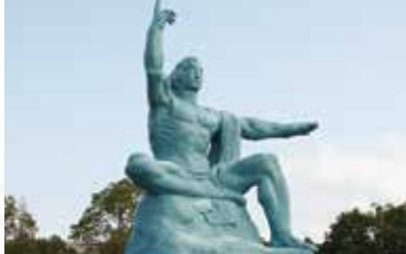
Nagasaki: Nagasaki Peace Park