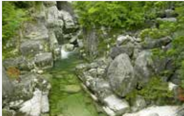
Yakushima Island: Yakusugi Land