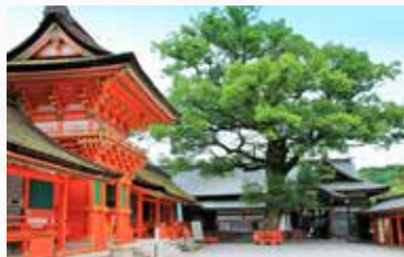
Usa: Usa Shrine