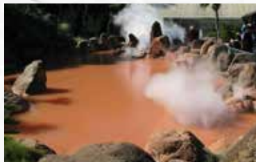
Beppu: Beppu Hells