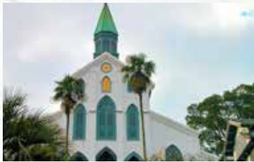
Nagasaki: Oura Catholic Church