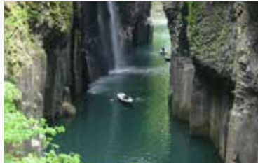
Takachiho: Takachiho Gorge