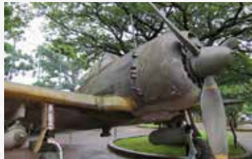
Chiran: Peace Museum for Kamikaze Pilots