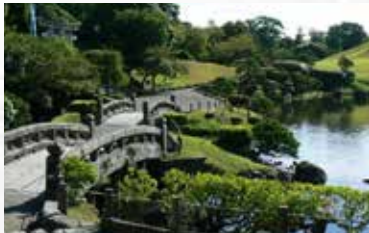
Kumamoto: Suizenji Garden