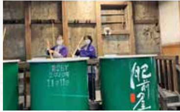
Kashiwa: Yutoku Inari Shrine