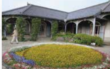
Nagasaki: Glover Garden